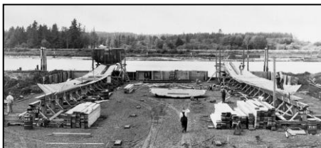
YMS 100 & 101 at Astoria Marine Construction Co. Oregon 28 August 1941