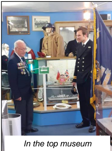
In the top museum