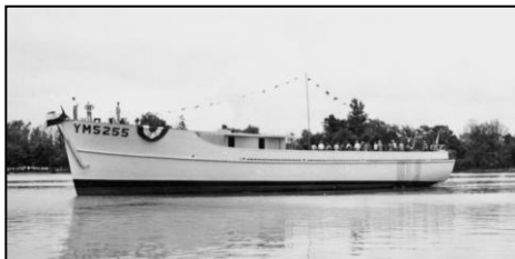
Day of launch YMS 255 later BYMS 2255 at Mojean & Ericson, Tacoma Washington 25 April 1943