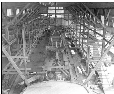
YMS 135 being laid down at Astoria Marine Construction Co. Oregon May 1942