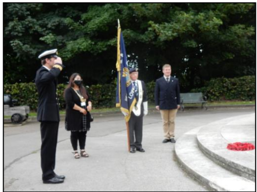
C.O., Dep Mayor, Std Bearer, NLO

They all signed our visitors book before moving on to the next part of the visit which was to lay a wreath at the memorial in Belle Vue Park and this part was covered by the local press photographer. Unfortunately, because of the ongoing COVID restrictions, only the Commanding Officer was allowed to leave the ship and nobody was allowed to visit the ship so with only 6