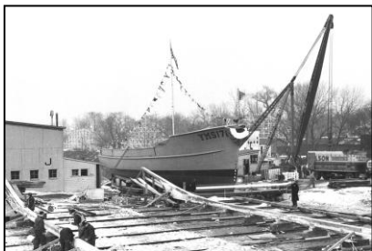
YMS 176 ready for launch at H C Grebe & Co. Chicago January 1943

In the last issue of the newsletter I mentioned about some previously unseen negatives that we discovered during our archive work and that we were getting them professionally digitised. What we found was that a lot of the negatives were to do with the building of the YMS/BYMS minesweepers in America. We will be using some of the images to create a BYMS display in the museum but as a taster here are some of the pictures here.