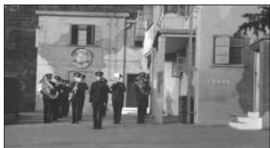
Royal Marine Band playing for divisions (HMS Europa)