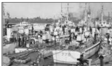
Coastal Forces craft in the Hamilton Dock (HMS Mantis)