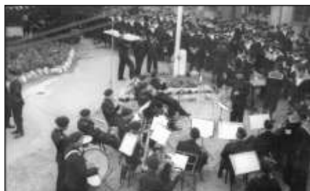
The Royal Marine Band play while the sailors queue for their rum issue (HMS Europa)