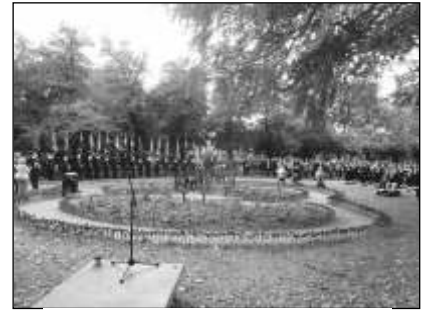
The new memorial Poppy Garden in Belle Vue Park