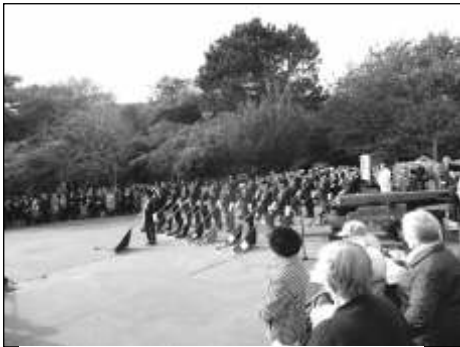
The standards dip in salute at the service at our memorial