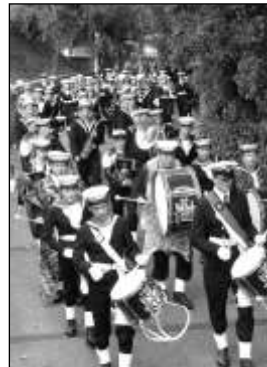
The band march up Cart Score