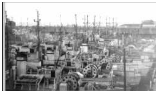
Motor Minesweepers in the Trawl Dock at Lowestoft (HMS Martello)

I was recently asked to give a talk at a local theatre on the “stone frigates” of Lowestoft during WW2. In total there were 9 base names associated with the town of Lowestoft during the war. These were HMS Pembroke X, HMS Minos, HMS Minos 11, HMS Mantis, HMS Myloden, HMS Martello, HMS Romola, HMS Europa and finally HMS Europa 11. These covered a variety of uses including Harbour defence, Coastal Forces, landing Craft, Combined Operations, gunnery training, accommodation, Minesweeping and administration. All the bases occupied commandeered properties and sites covering most of Lowestoft and the surrounding area and HMS Europa alone commandeered 64 properties and sites during the course of the war. In addition to the vast Naval presence in the town there was also a lot of Army who manned the coastal guns, the Royal Observer Corps manning lookout posts and British and American Air forces at the numerous airfields in the area.