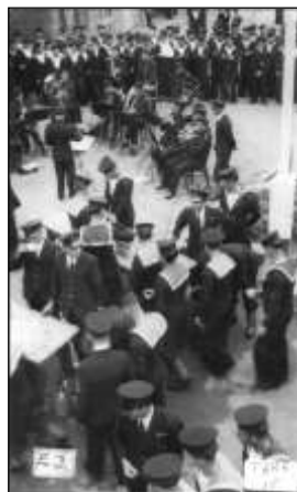
Rum being issued from the barrel (HMS Europa)