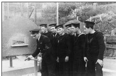
Stoker training at the Oval (HMS Europa)