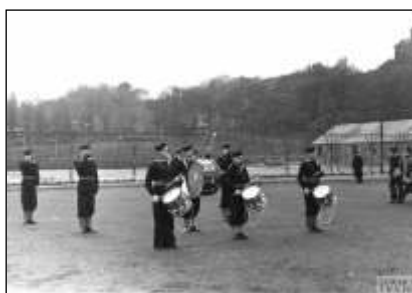
Blue Jacket drum & bugle band on The Oval (HMS Europa)