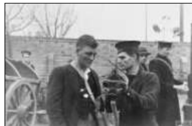
Gas mask instruction for a new recruit (HMS Europa)