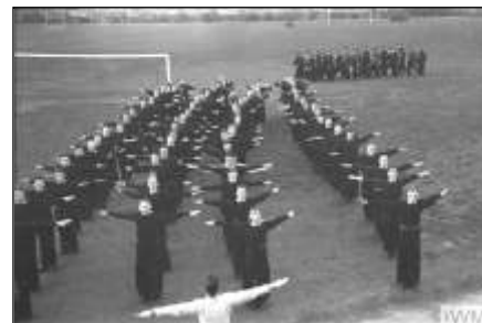
PT on The Oval (HMS Europa)

At the beginning of the war the Royal Navy had 1,400 ships, this increased with new builds, requisitioned and lease lend. The Patrol Service alone added about 6,000 to the total. By the end of the war 873,000 personnel had been in uniform under the White Ensign which included RN, RM and WRNS, they lost 63,787, roughly 7%. Of the 873,000 the Patrol Service made up 7½% but their losses amounted to 23% of the overall total. The Royal Navy today has 74 ships and 30,000 personnel.