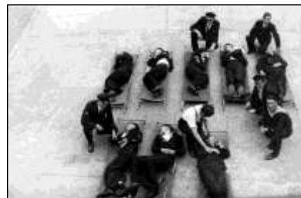
There are always those that cannot handle it! (HMS Europa)