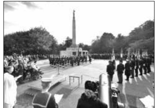
The parade formed up at our memorial