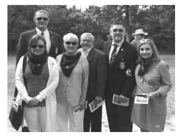
Some of our representatives