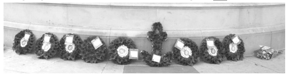
Tributes laid at the 2011 reunion