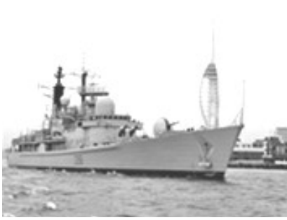
HMS Gloucester, the "fighting G"

HMS Gloucester was one of the first of the Type 42 Destroyers and built by Vosper Thornycroft at Southampton and launched in 1982. Unfortunately due to defence cuts she is now to be de commissioned at the end of June this year.