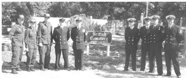
Royal Navy with US Coast Guard at the British Cemetery

HMS Gloucester is on the final leg of her Atlantic Patrol South deployment where she has been on patrol around the Falkland islands.