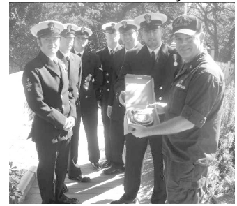
HMS Gloucester present ship's badge to US Coast Guard